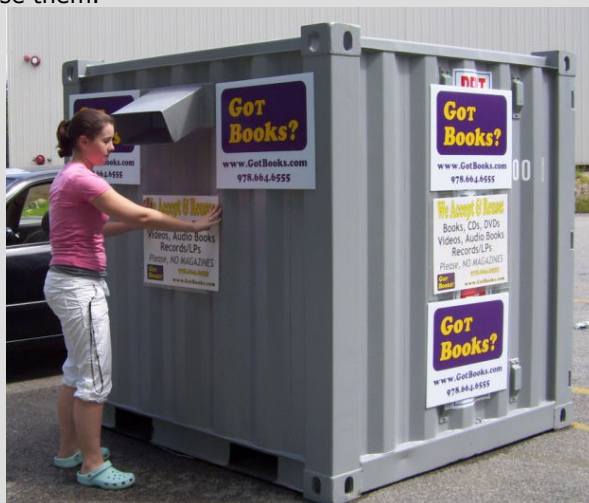
Takes up less than an average parking space: 6' x 6'6" x 6'6"